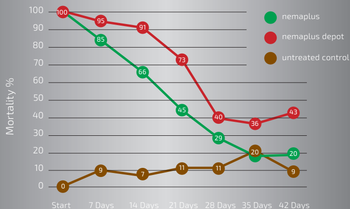
Comparison: drench vs. capsule application of S. feltiae

Bioassay with mealworms, Katz Biotech AG 2020